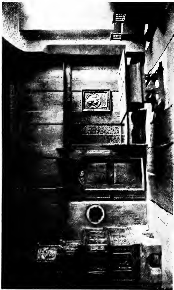
THE LIVING-ROOM of Luther's house at Wittenberg, furnished as it was in his day. Here most of the table-talk originated.